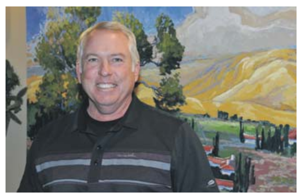
Mayor Roger Wykle